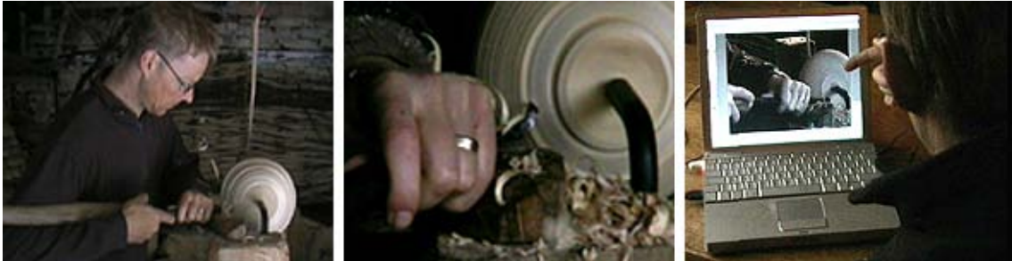
Figure 1 Craft practitioner: traditional bowl turner, Robin Wood.

To consider in greater detail the acquisition, representation and execution stages: