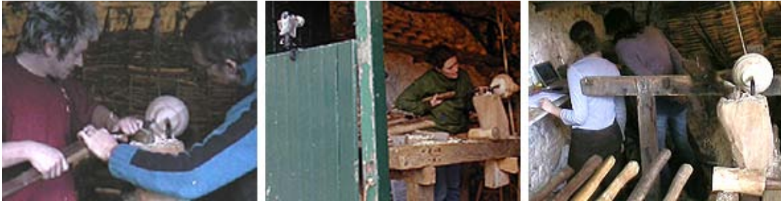
Figure 4 Learners in the workshop.

development. In much the same way as Ehn and Kyng 17 used their “cardboard computer” to enable print workers to imagine using a computer that had not yet been built, my note book and video clips allowed both myself and learners to imagine how the learning resource might work. By playing the role of interface between the learner and the material, I was able to involve responses from the learners and adapt the material I had dynamically during sessions to maximise their impact.